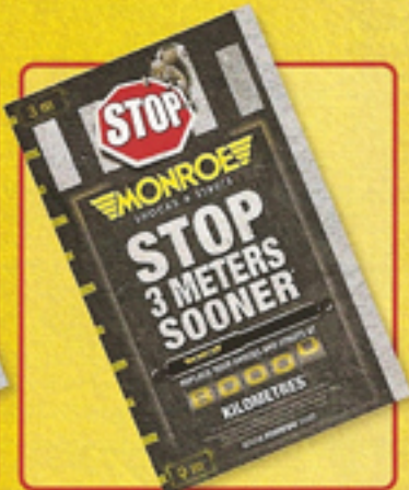
Floor Decal (55.88cm x 88.9cm)