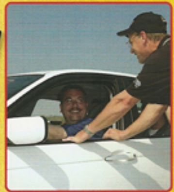
Ride and Drive Training Clinics