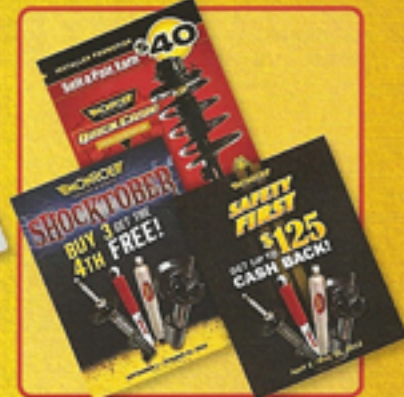
Consumer and Trade Promotions