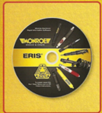
ERIS Electronic Catalog