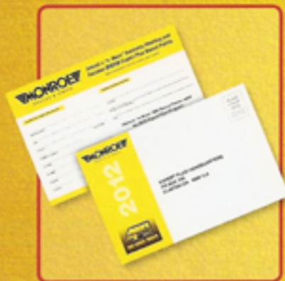
"4-More" 200-Point Bonus Card