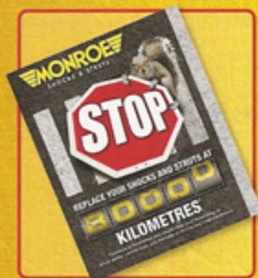
Window Cling (45.72cm x 55.88cm)

Reward Yourself for Online Training Take the online tests to earn valuable rewards