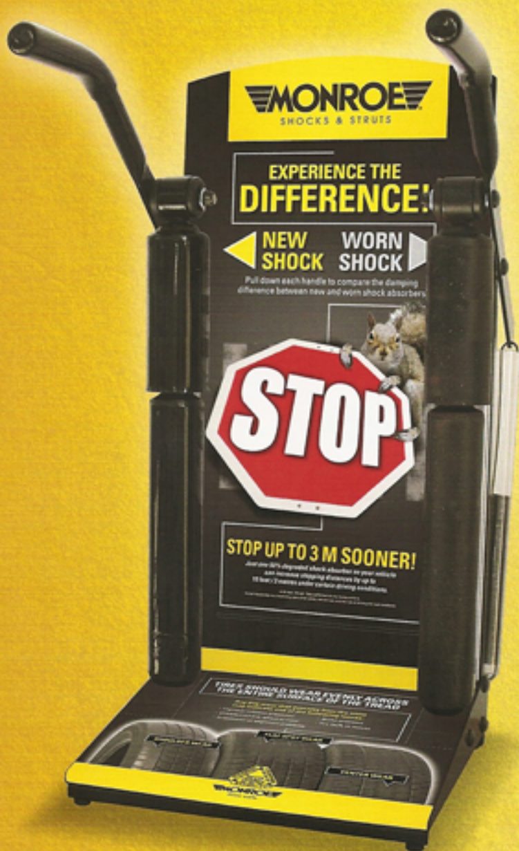
Monroe ® Shock Counter Top Display Featuring recommended replacement messaging