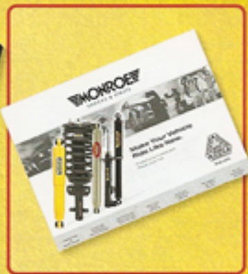
Ride Control Flip Book