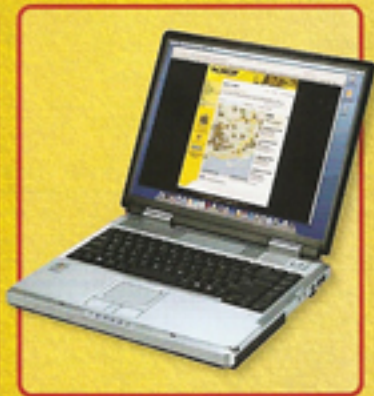
Dealer Locator Service