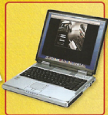
Online Training Rewards